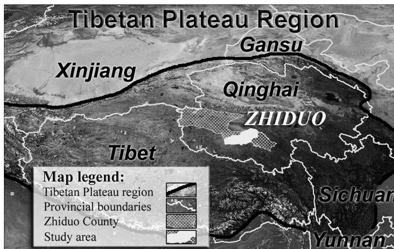
Figure 6.1 Location of Zhiduo county in People's Republic of China